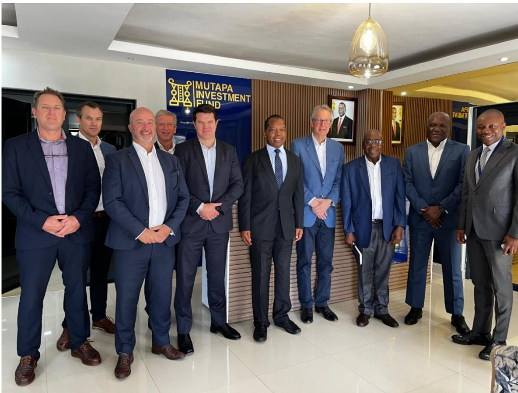
Figure 3 - Invictus Energy meeting with Mutapa Investment Fund in March 2025

The revised agreement is in its final stages of preparation and is being fast-tracked for execution in the coming weeks.